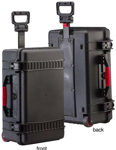
AMRESTRAP for BAG